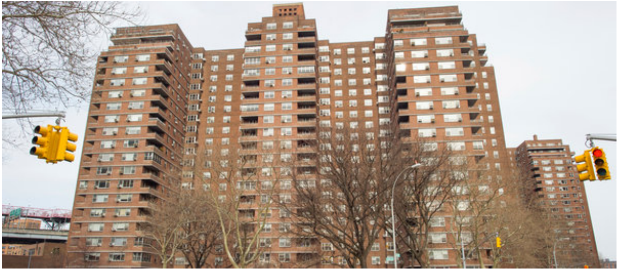
570 GRAND STREET, #H406 A one-bedroom co-op with a renovated kitchen and bath and a balcony, listed at $659,000.

At last count, the neighborhood had 122 art galleries , said Sue Stoffel, an art collector who administers a gallery map and website, LES Galleries NYC .