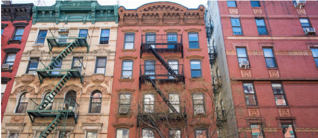
134 ELDRIDGE STREET, #6 A two-bedroom one-bath co-op with income restrictions, listed at $800,000.

In 2015, the median sales price of a one-bedroom co-op on the Lower East Side was $550,000, up 10 percent from 2014, according to Gregory J. Heym, the chief economist at Terra Holdings; for a two-bedroom co-op, it was $829,000, up 15 percent. The median for a one-bedroom condo was $1.4 million, an increase of 20 percent over 2014; for a two-bedroom condo, it was $1.8 million, an increase of 13 percent. Sales of three-bedroom condos and co-ops were rare, he said.