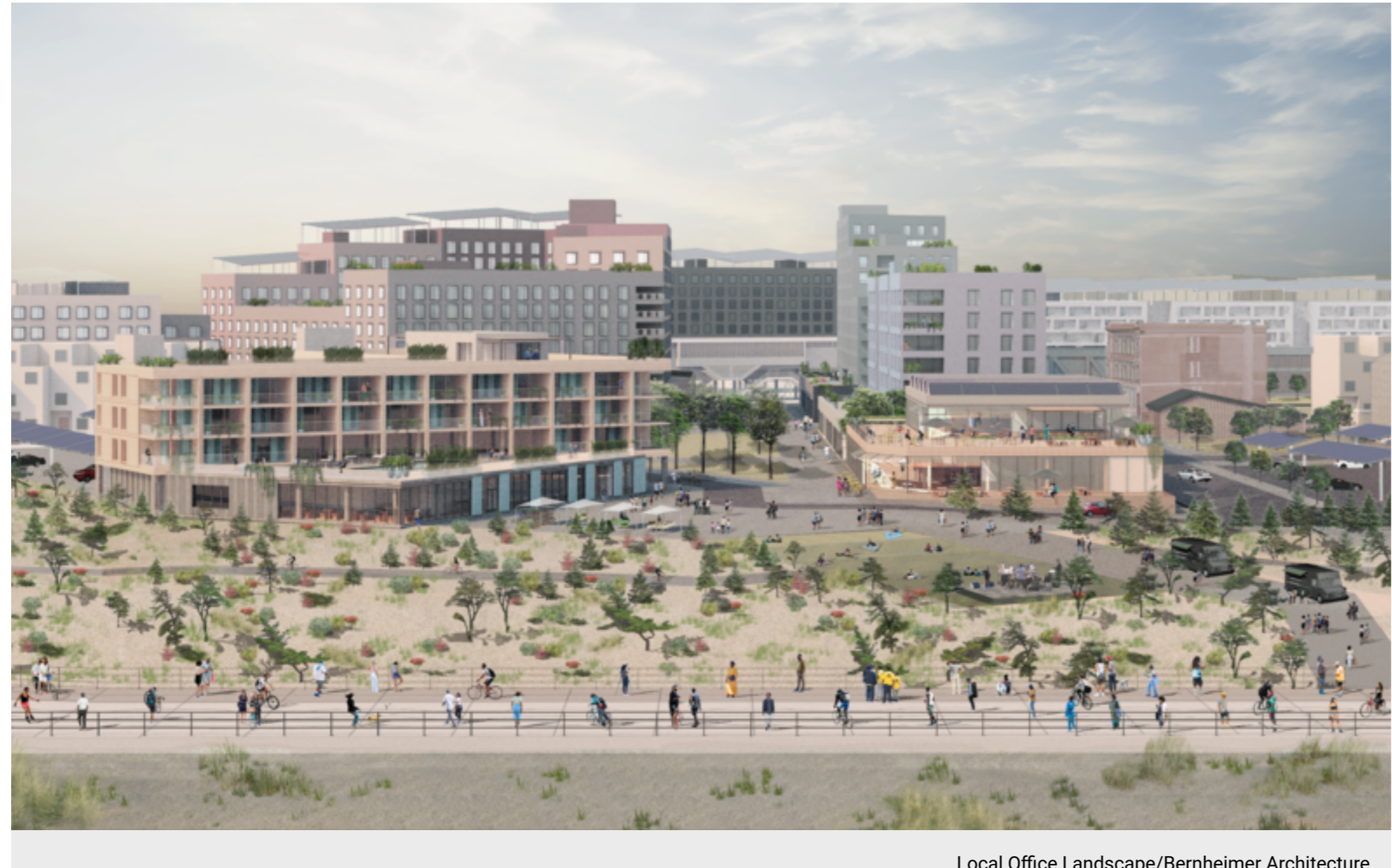
A rendering of Arverne East

L+M Development Partners, the Bluestone Organization and Triangle Equities have closed on $30.3 million in financing for the first phase of Arverne East, a 116-acre oceanfront development in the Arverne and Edgemere neighborhoods of the Rockaways.